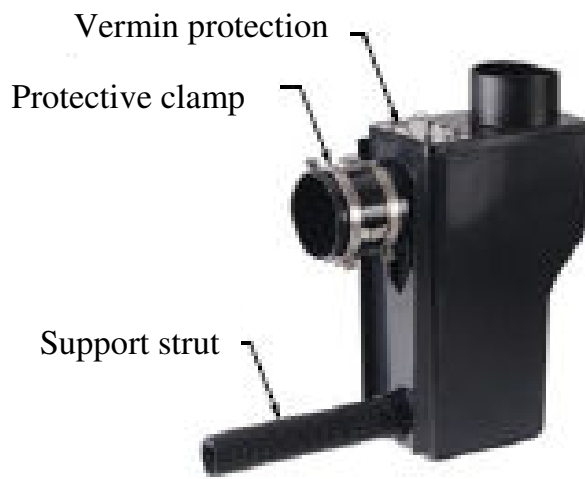
(WISY WS1002) Multi-functional Overflow Device

NOTE: Dimensions shown in parentheses are in millimeters.